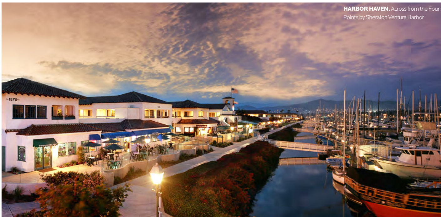
HARBOR HAVEN. Across from the Four Points by Sheraton Ventura Harbor