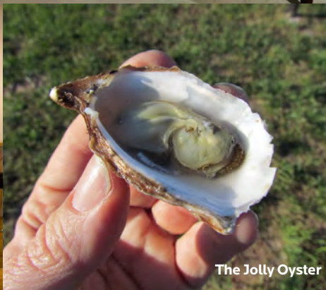
The Jolly Oyster